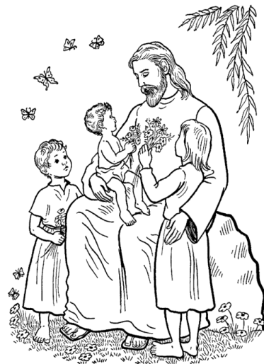
Jesus loved little children. When parents brought their children to Him, He took them in His arms and blessed them.